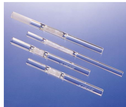
Figure 1. How SGE FocusLiner™ works

Incidentally, the HP6890 is supplied with a splitless style liner. Reproducibility evaluation on this liner gave results between 17 and 34% RSD for the compounds, emphasizing the need to use the correct liner for the injection mode used.