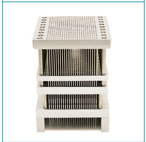
864, 5 \mu L array syringe