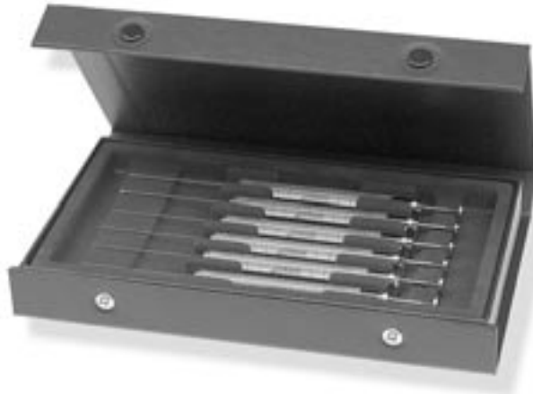
6 pack Syringes

When you purchase SGE's Syringe Multipacks, you SAVE MONEY and reduce your cost per analysis without compromising on quality.